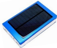
Renewable Power Source

The PowerPAK Mini Filtration System is your personal mini utility company. This renewable power system can provide you POWER, LIGHT, and Fresh Filtered WATER.